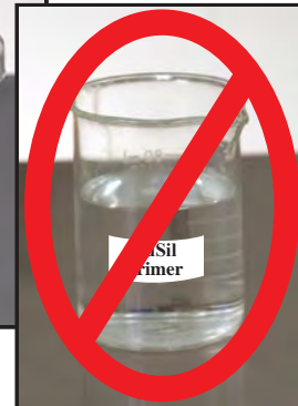
Do not leave uncovered for long periods of time