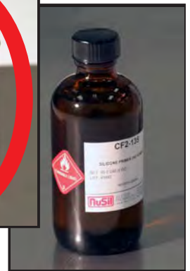
For long term storage, keep in original container