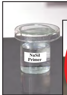
Store covered when not in use